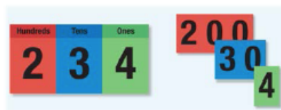
(Above) Place Value Chart, to the millions place